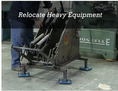
Relocate Heavy Equipment