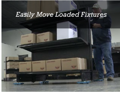
Easily Move Loaded Fixtures