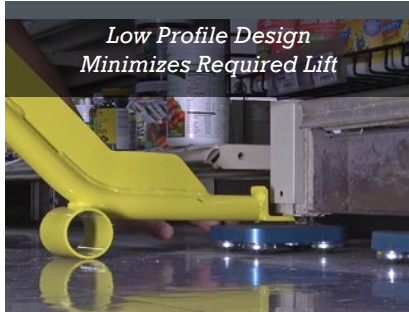
Low Profile Design Minimizes Required Lift