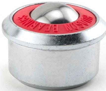
HDBT 1-3/16 CS